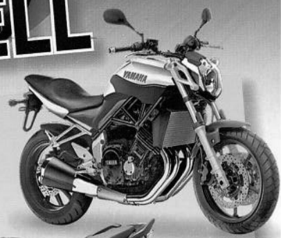
Yamaha 650 DIVER-SION