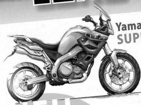
Yamaha SUPER TÉNÉRÉ